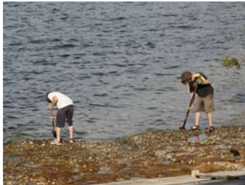
Take that Oysters