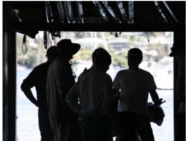
The Seaforth Adventures