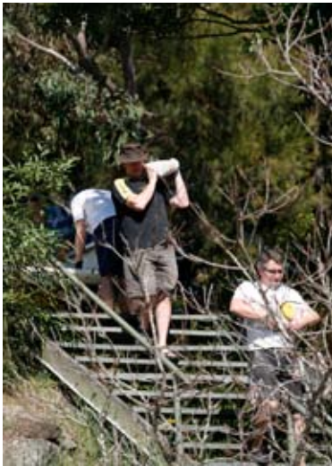
200 to go