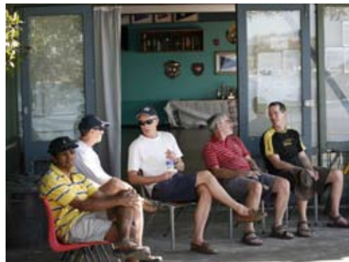
A well earned break