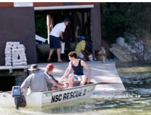
Another load of cement